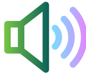
Sound insulation testing