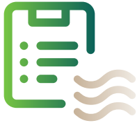
Diagnostic air leakage testing