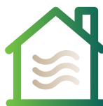
Passive house air leakage testing