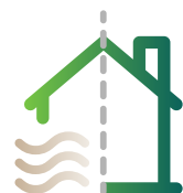
Retrofit pre and post air leakage testing