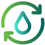
Water efficiency calculations