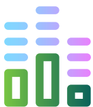
Sound insulation design