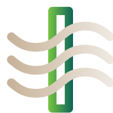
Air leakage drawing review