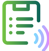
Diagnostic sound insulation testing