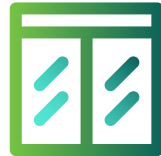
Over glazed extension calculations