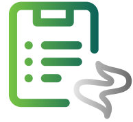
Diagnostic smoke testing