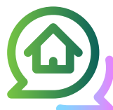
On-site Design Advice